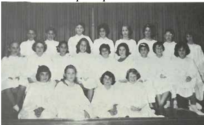
Temple Israel Youth Choir, 1963

Generously sponsored by the Temple Israel Foundation's Lapid Shapiro Fund